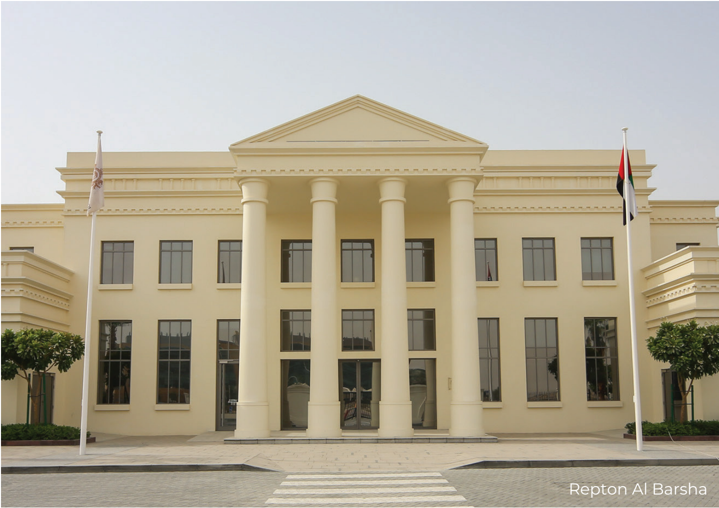
Repton Al Barsha