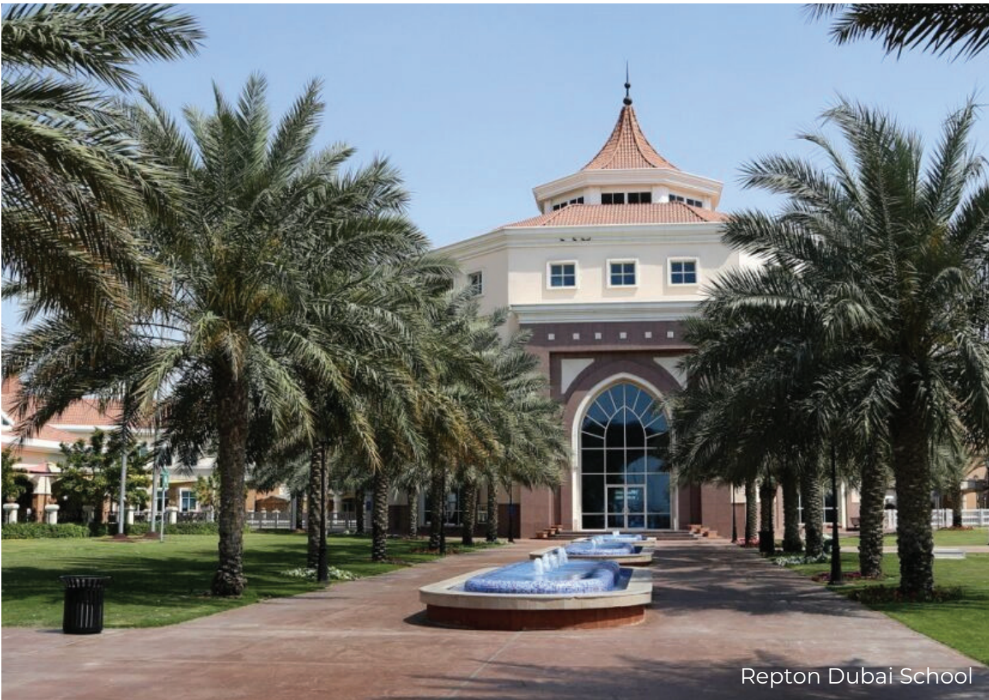
Repton Dubai School